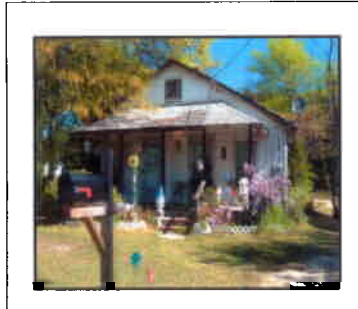
Home to be Renovated with CDBG funds

Application requests for the Spring 2004 funding round are due March 18th. Contact Robin Cooley (803-376-5390) for more details.