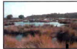
SC Wetlands need protection as Development continues.

late December 2003 and hopes to select a consultant in early February.