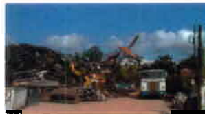
Brownfield Sites Have Redevelopment Potential