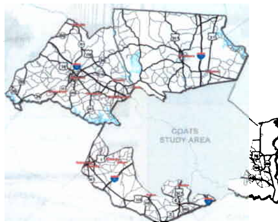
CMCOG Rural Transportation Study Area

This revised approach has been designed to allow local citizens more opportunity to identify potential projects and comment on proposed improvements. Four preliminary